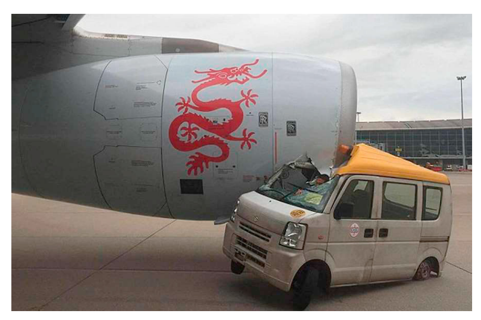
Fig. 2. Accident at Hong Kong airport (https://www.telegraph.co.uk/travel/news/watch-van-crash-into-plane-as-it-prepares-for-take-off/).

Moreover, such accidents occur not only in the air but also on the ground, a collision at the Hong Kong airport can serve as an example of such events (Fig. 2).