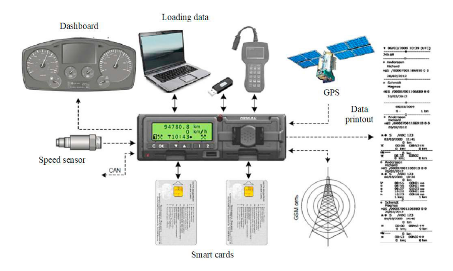
Fig. 3. How the tachograph works (https://auto-tahograf.ru/tahograf/takhograf-mikas/takhograf-mikas-s-skzi/).

Currently, the maximum requirements for equipping with controls are imposed on passenger vehicles, as well as vehicles carrying dangerous goods. A mandatory additional means of control, which should be equipped with such vehicles, according to both Russian and international regulations, is the tachograph (Fig. 3).